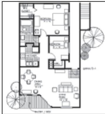
Two Bedroom / One Bath ~ 766 Sq. Ft.