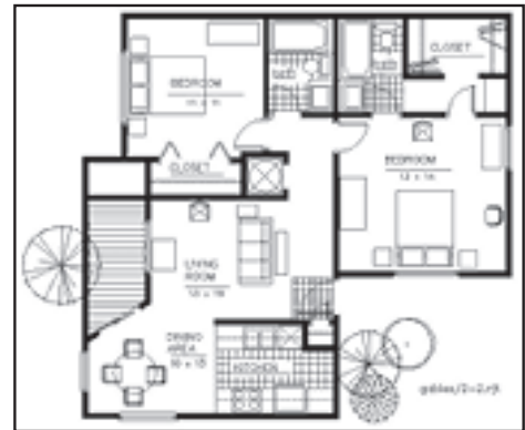
Two Bedroom / Two Bath ~ 936 Sq. Ft.

We also have one other floor plan available, a 1 bedroom plan at 480 sq. ft. For further information please call us at (866) 298-4717, or visit our website at www.dtiproperties.com .