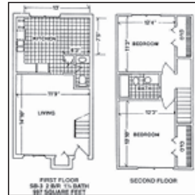
Two Bedroom / One and a Half Bath 997 Sq. Ft.

We also have one other floor plan available, a 2 bedroom, 1 1/2 bath plan at 830 sq. ft. For further information please call us at (866) 298-4717, or visit our website at www.dtiproperties.com .