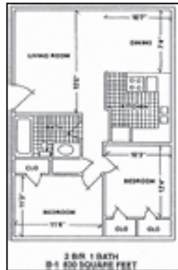
Two Bedroom / One Bath 830 Sq. Ft.