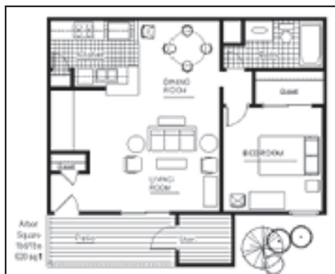
One Bedroom / One Bath ~ 620 Sq. Ft.