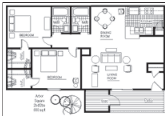
Two Bedroom / Two Bath ~ 880 Sq. Ft.

For further information please call us at (866) 298-4717, or visit our website at www.dtiproperties.com .